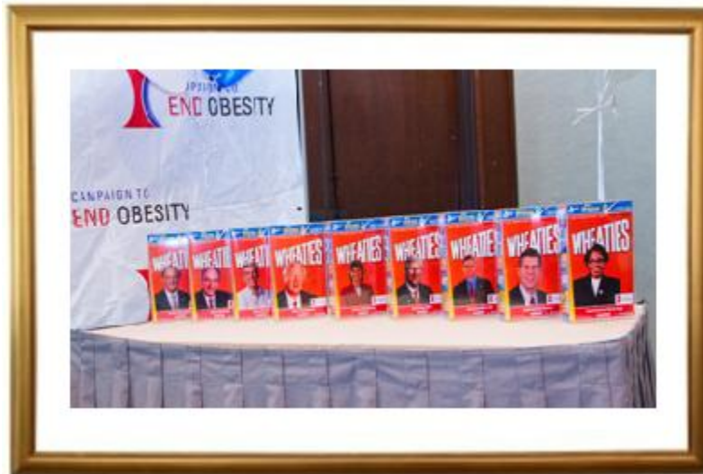
The 2013 CEO Breakfast with Champions Honorees